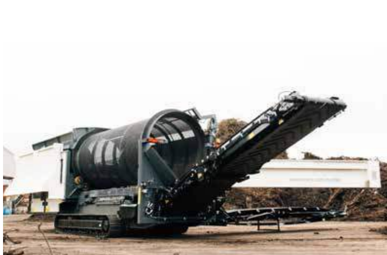
Double-sided unrestricted drum access via two large swing-out doors, enabling easy maintenance and cleaning