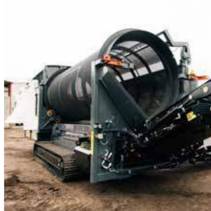
Easily replaceable 4.7m (15'5") x 1.8m (5'1") punch plate drum which is compatible with the Doppstadt SM 518