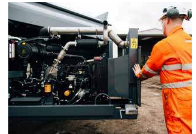
Swing out engine cradle providing operators with unrivalled maintenance access