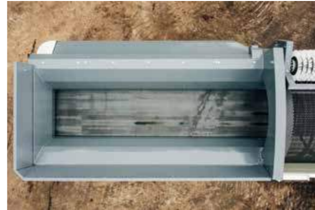
Advanced feeder control system offering efficient operation and maximised output