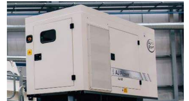
Low noise 60kVa generator offering excellent fuel consumption and serviceability