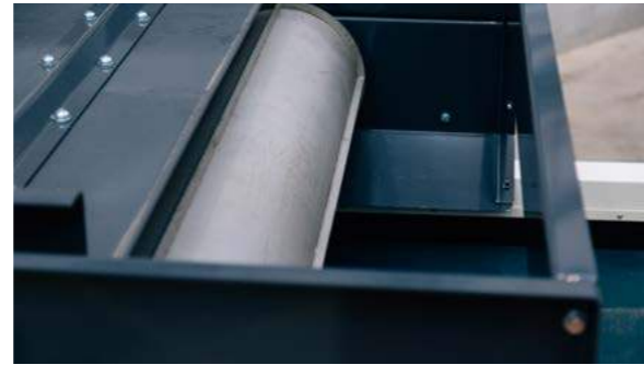
Variable speed 2m (6' 7") wide high strength neodymium radial pole drum for optimal ferrous metal recovery