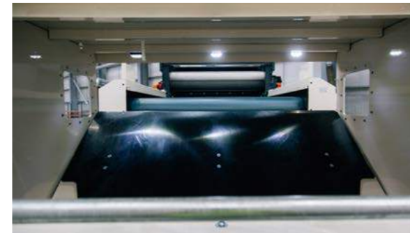
22 pole neodymium eddy current rotor surrounded with an ultra-thin carbon fibre shell to maximise non-ferrous metal recovery