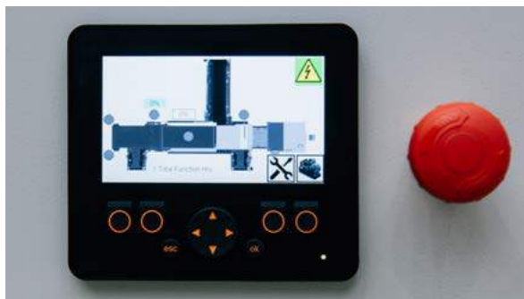
User friendly colour display offering simple operation and diagnostics Customisable settings allow operators to tailor the machine for specific applications