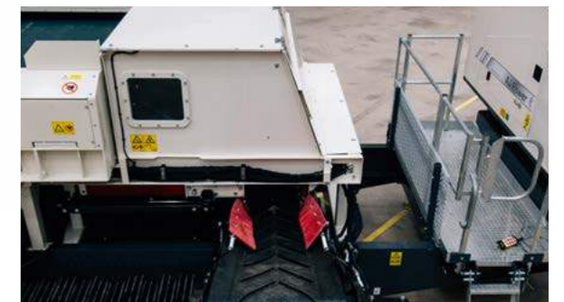
Movable splitter box allowing optimal material flow whilst enabling the machine to fold within 3m wide transport width Unrivalled maintenance access