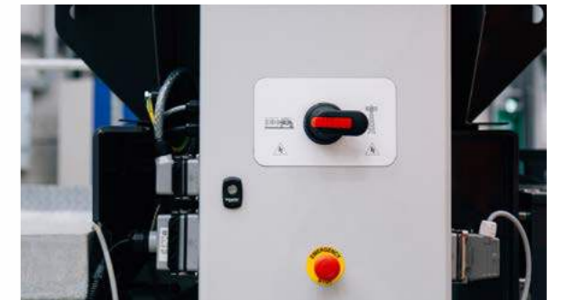
Change over switch as standard to allow the use of onsite mains power